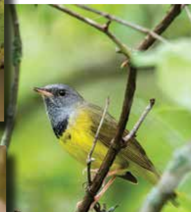
Prairie Warbler. Mourning and Worm-eating Warbler.