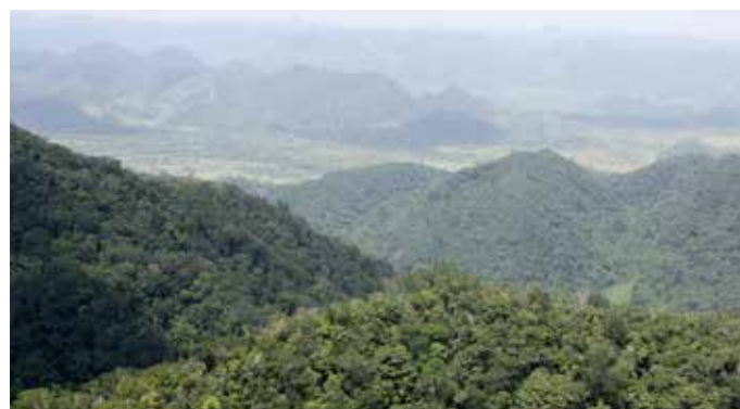
Caribbean biological corridor in Guatemala.