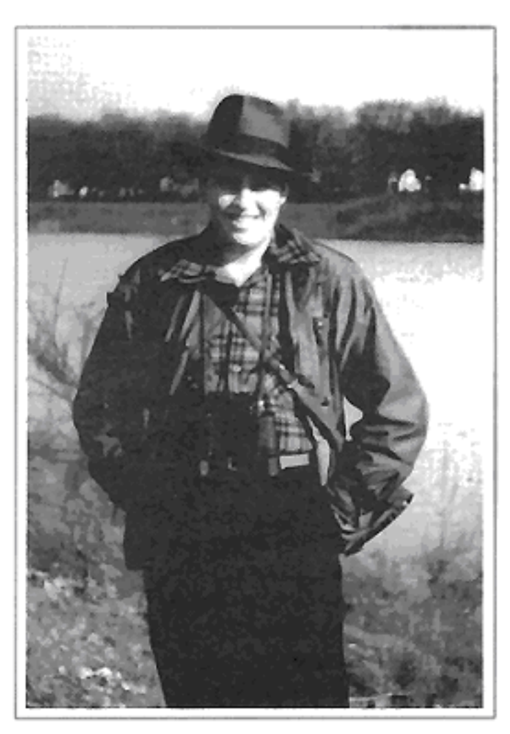
The author on a birding trip near Riverside Park in 1947.