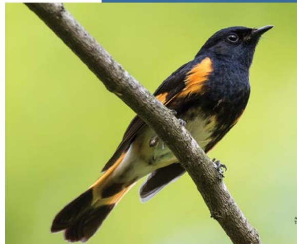
Top: Yellow-billed Cuckoo, Brandywine Park. Center: Red-tailed Hawk, Brandywine Park. Bottom: American Redstart, Thornwood Nature Preserve.