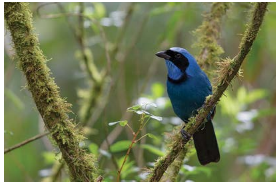
Turquoise Jay